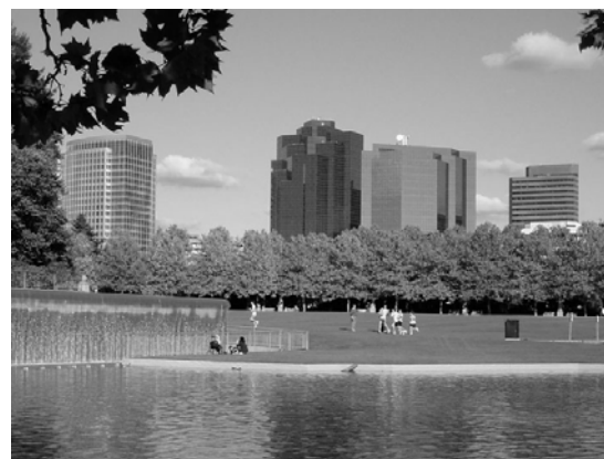
Site: Bellevue's Downtown Park