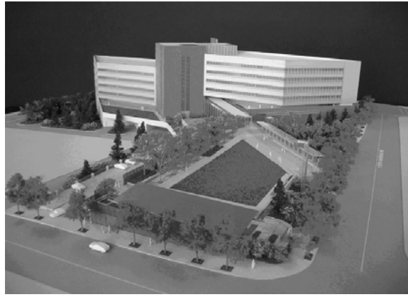
Site: Model of Bellevue's new City Hall